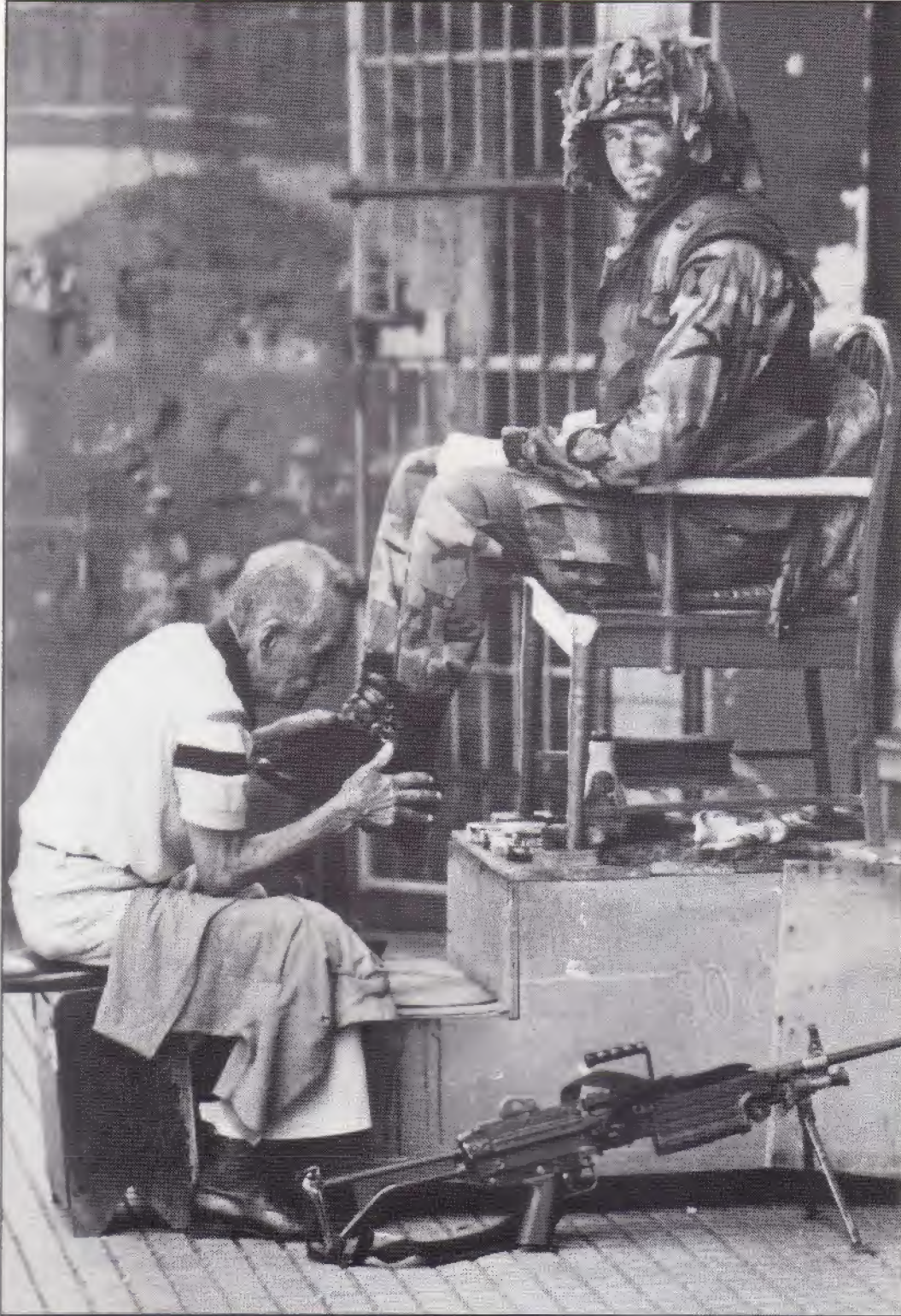
Colonialism Triumphs in Panama